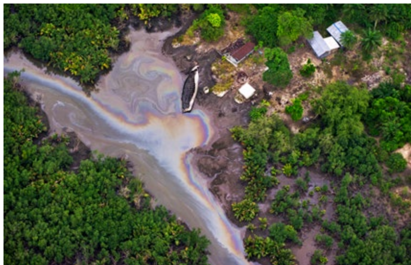
Oil pollution

It is only with an inclusive and connected society that harmony can be found. It would be of great benefit to everyone living in Nigeria if the government made significant strides to enhance public participation and inclusion of all.