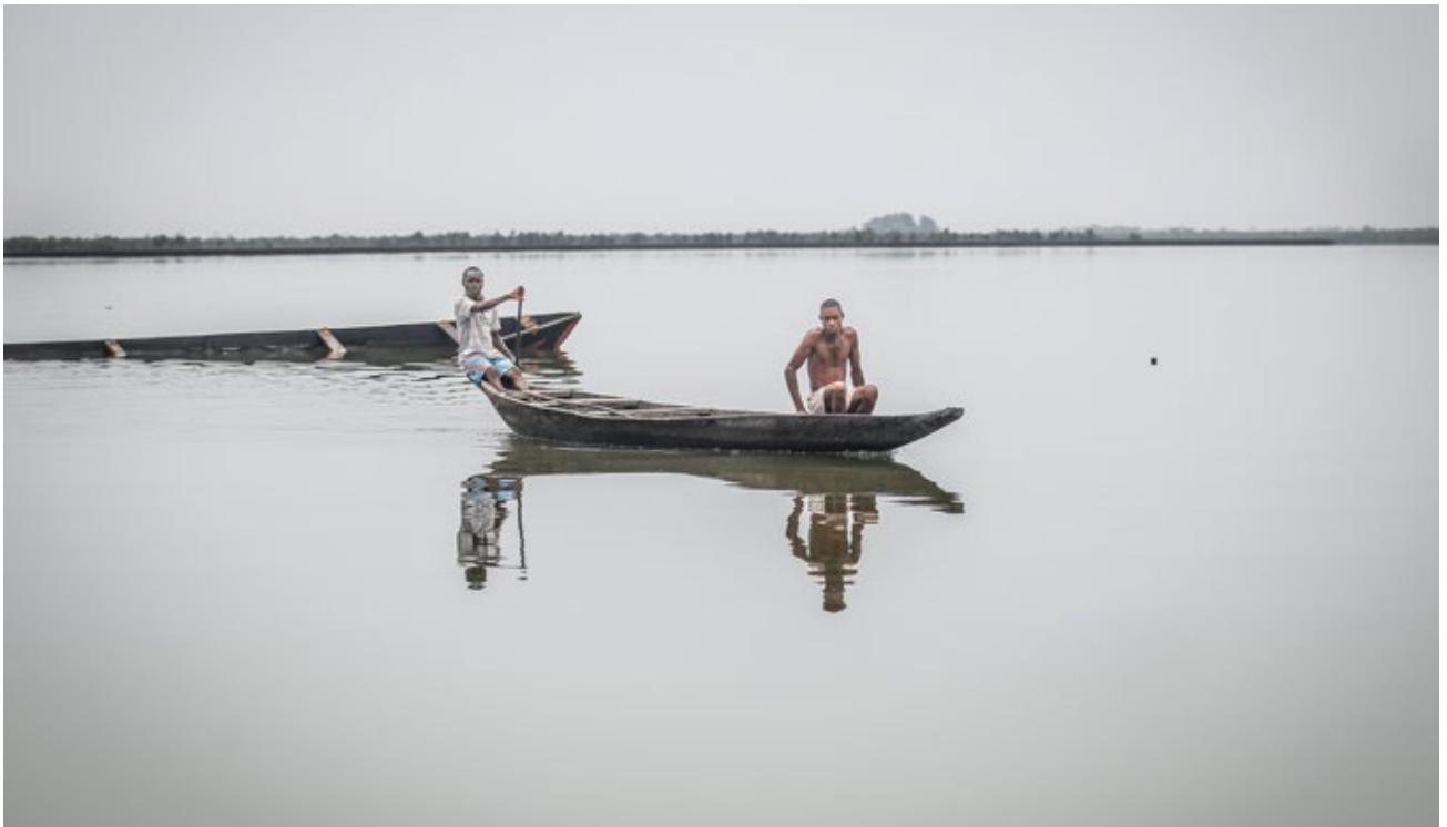
Men paddling on lake

Furthermore, many of the issues and recommendations mentioned earlier in the report should also, where appropriate, be addressed by the government. This addendum reflects the limited supplementary guidance that is government-specific, which emerged as a byproduct of the research. To provide a more nuanced and comprehensive landscape of issues and opportunities for change on the policy design and implementation level, further dedicated community-centered research is required.