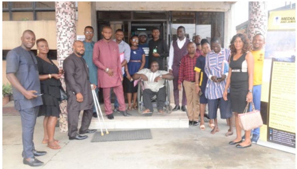
PWD focus group

3.2.2. Show solidarity to PWD activists by supporting their cause. This could include sharing their calls to action on your own platforms, offering them logistical support (e.g. meeting spaces) or publicly adding your name, as an organization, to their campaign and asking your supporters to do the same.