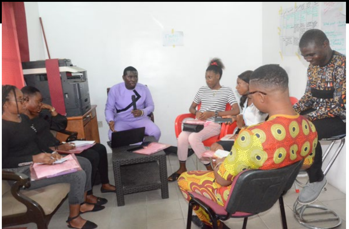
PWD focus group

Developed alongside focus group participants, the recommendations below will help to further the cause of disability justice and climate action in the Niger Delta, by building power for new solidarity between the two movements. We foresee them helping to create greater capacity to advocate for the implementation of existing policies around disability rights and to ensure that climate action can be taken by anyone for everyone.