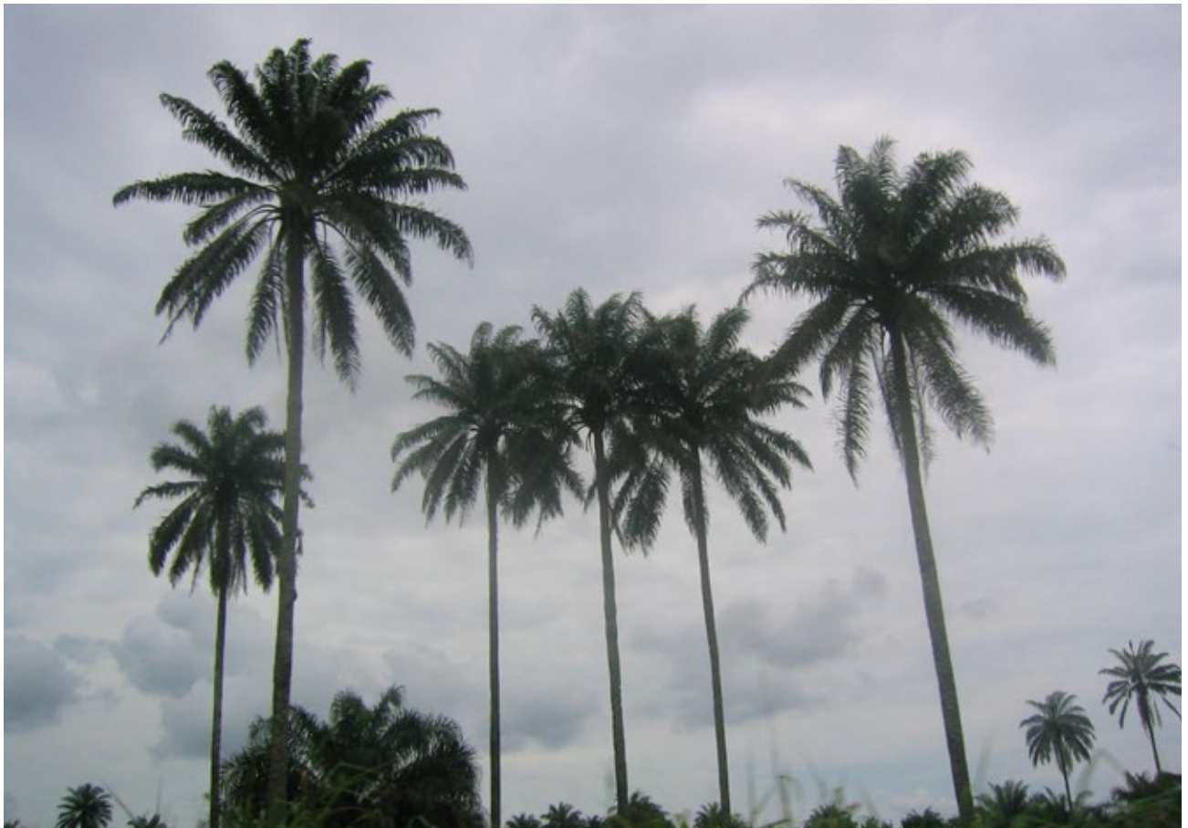
Palm trees