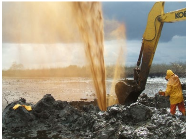
Person in oil field

While there was agreement that voices of PWDs need to be represented to a greater extent in the discourse around climate change, there were differing opinions amongst participants with regards to how PWDs will be further incorporated into the climate movement. Several CSO comments seemed to suggest that as well as