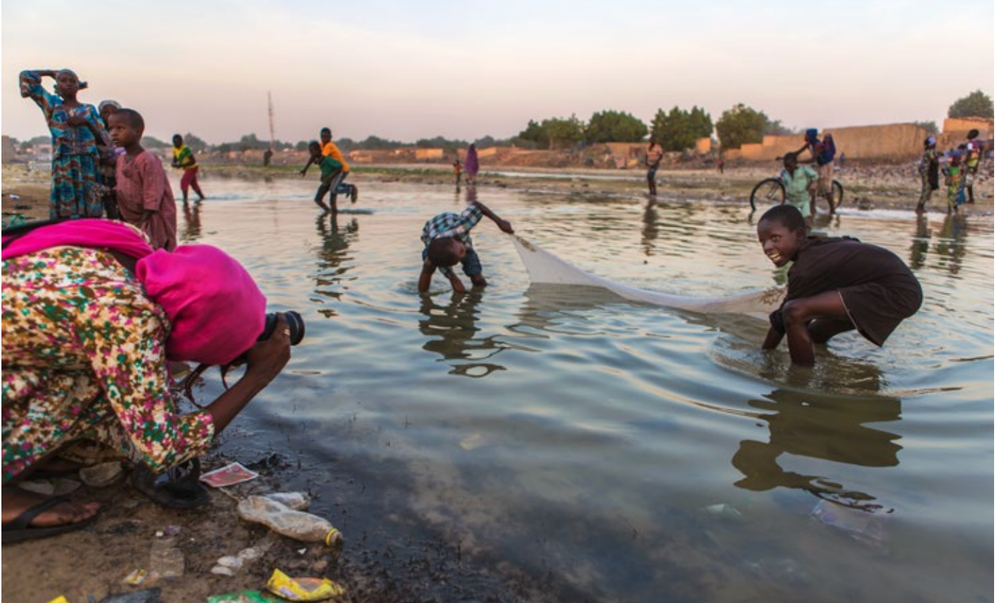
Everyday life in Bodo