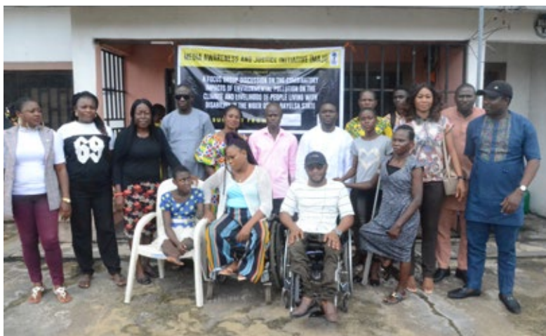
PWD focus group