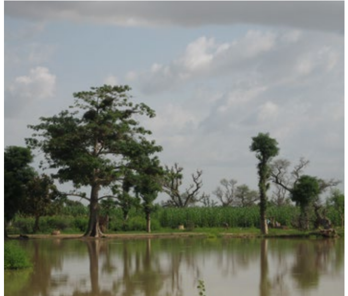
Mangrove

“During the rainy season, most of the time, [persons with disabilities] are not fully aware of how the roads and gutters are. Most times, they just walk, and they just fall inside the hole, maybe because there was no proper awareness or information about the right track they should follow so that they can be safe.” –PWD participant, Akwa Ibom State