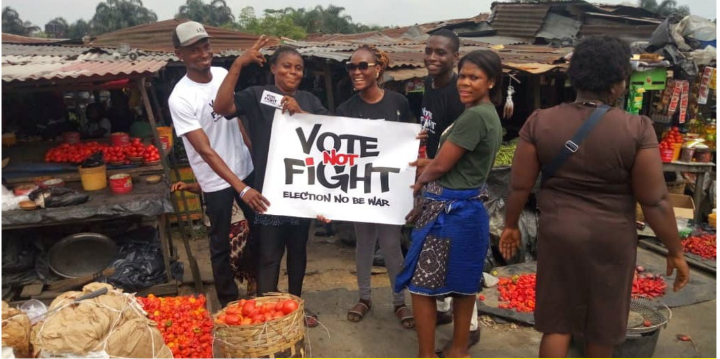
Media Awareness and Justice Initiative – Facebook