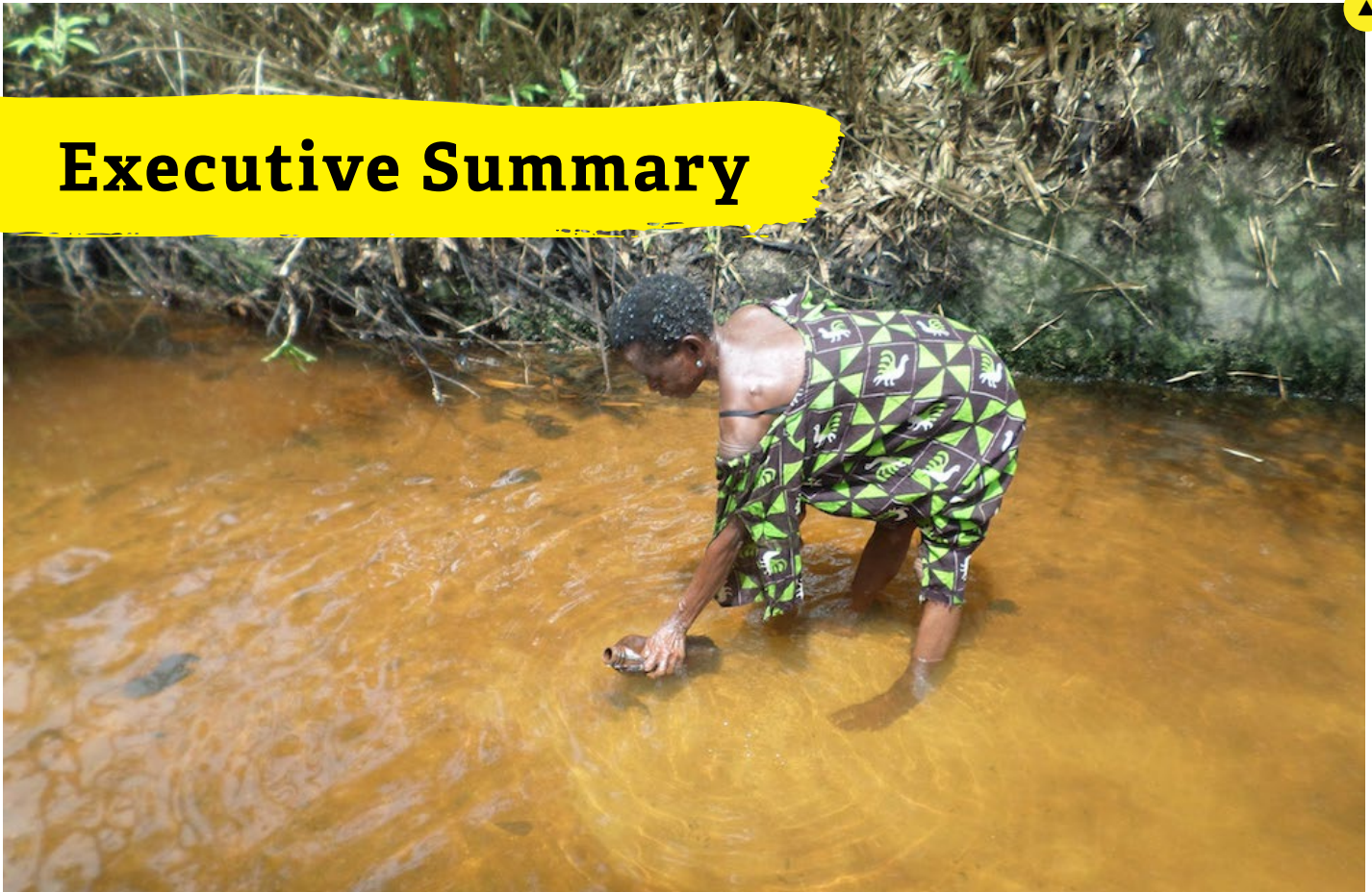
Woman fetching drinking water from a polluted stream