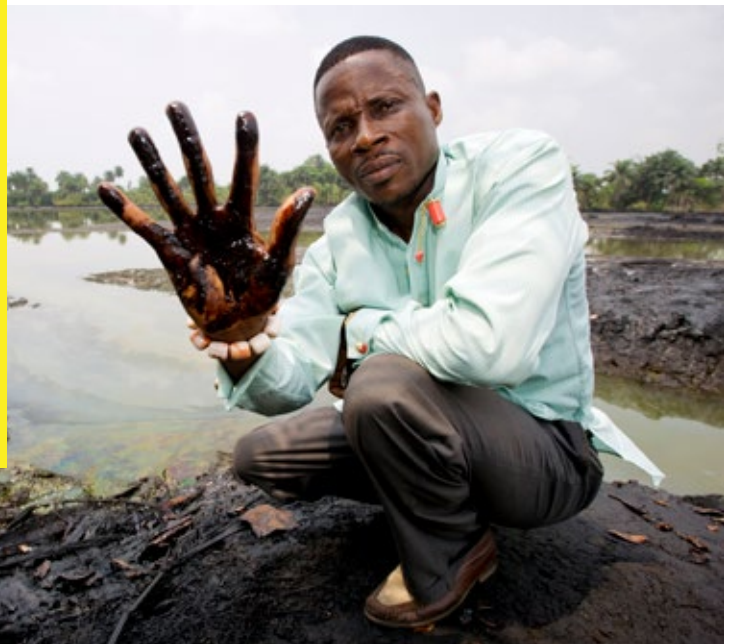
Man showing oil on hand

A narrative of care would center and recognize everyone’s personhood, as well as the interconnection between human beings and the wider ecosystem