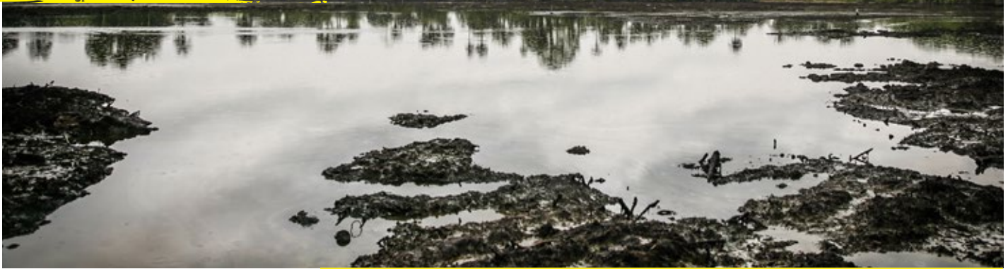
Polluted lake, by Milieudefensie, Akintunde Akinleye – Flickr