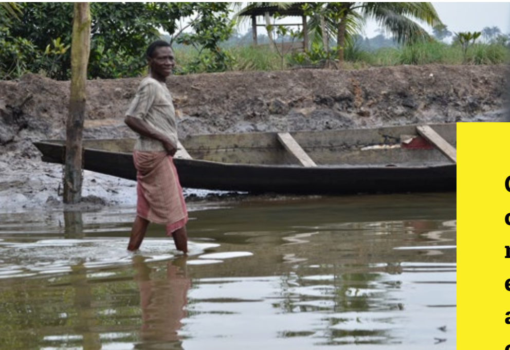
Person standing in polluted water

Our methodology is outlined in greater detail in the Appendices 1-6.