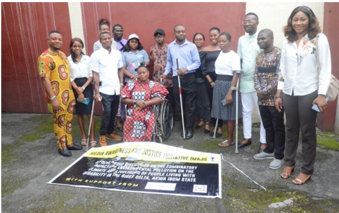
PWD focus group

“...when they lack the belief and competence in us, there is no way we can thrive in the Niger Delta, even if we have everything we need here.” – PWD participant, Akwa Ibom State