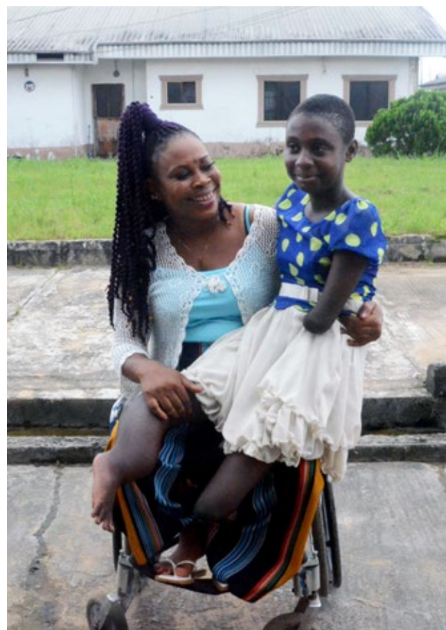
Woman in wheelchair with child.