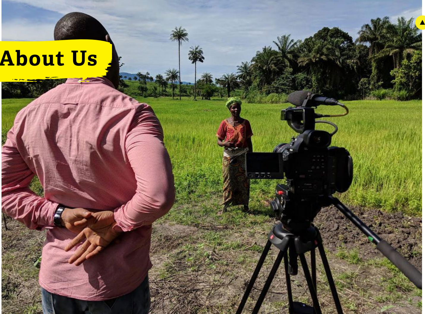
New Media Advocacy Project — Facebook