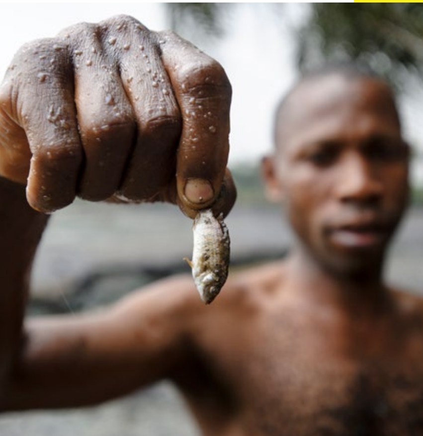
Dead fish

As the impact of climate change intensifies, not only do persons with disabilities disproportionately experience the harshest effects, more people are becoming disabled due to the short-and long-term impacts of changing climate and environmental degradation. This research has revealed the importance of investing the necessary resources, time, and dedication to remove barriers to a greater intersectional approach developing between these two movements. These will not only strengthen climate action, but will also further the cause of disability justice, which currently is disproportionately under-supported and granular.