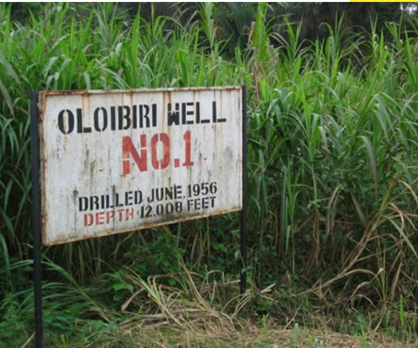
Site of first oil well

– Disability CSO representative, Rivers State