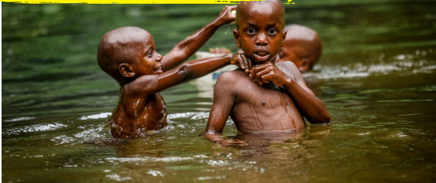
Children swimming in Ikot Ada Udo