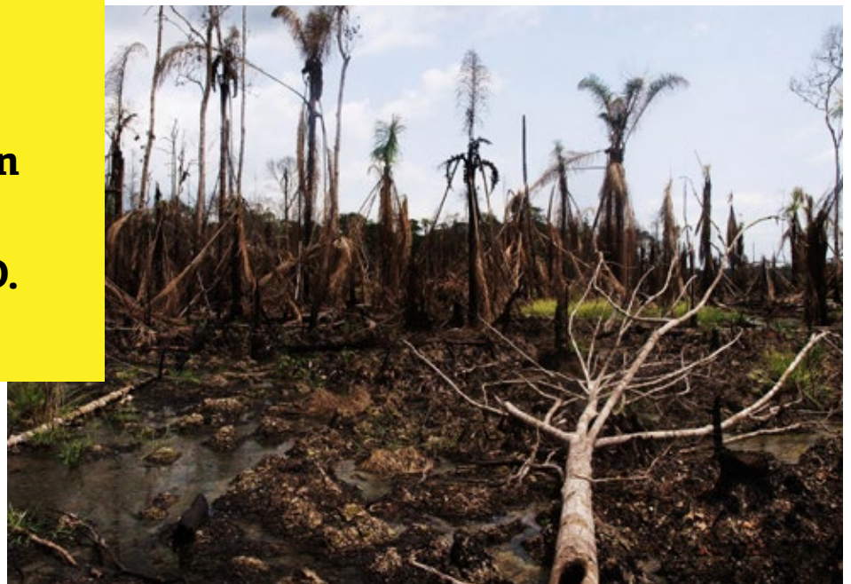
Dead forest

We are also sensitive to the fact that nobody on the research team identifies as a PWD.